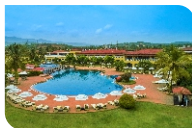
The LaLiT Golf & Spa Resort Goa