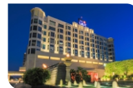
The LaLiT Jaipur