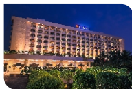
The LaLiT Mumbai