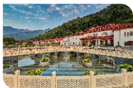
The LaLiT Grand Palace Srinagar