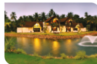
The LaLiT Resort & Spa Bekal (Kerala)