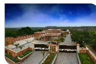
The LaLiT Mangar