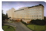
The LaLiT Ashok Bangalore