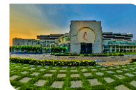
The LaLiT Chandigarh