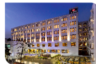
The LaLiT Great Eastern Kolkata