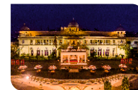
The LaLiT Laxmi Vilas Palace Udaipur