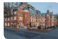
The LaLiT London