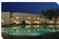
The LaLiT Temple View Khajuraho